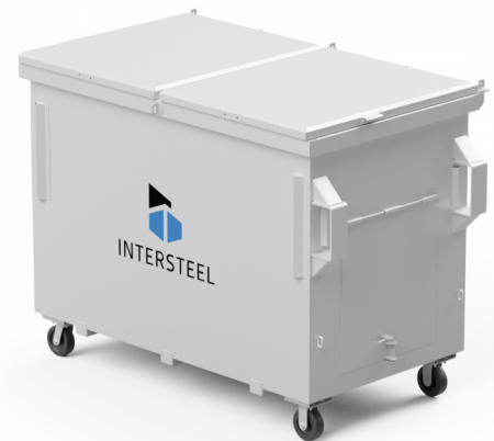
Listed dimensions are standard, however all containers can be custom made according to your specifications