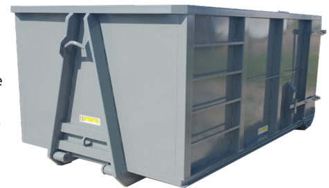
Listed dimensions are standard, however all containers can be custom made according to your specifications