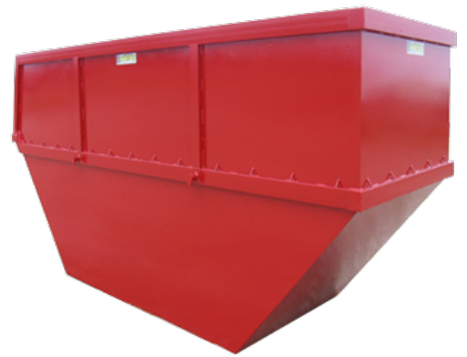
Listed dimensions are standard, however all containers can be custom made according to your specifications