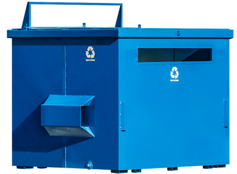
Listed dimensions are standard, however all containers can be custom made according to your specifications